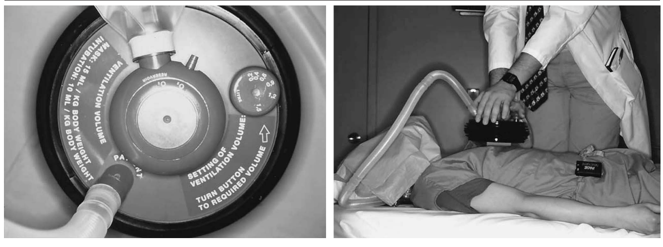
Patient simulation showing a bird's-eye view of the device and a lateral view of use.

Figure 4. CardioVent bellows on sternum resuscitation (BSR-CPR)