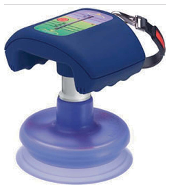
Figure 2. Impedance threshold device

Figure 1. Active compression-decompression (ACD) device