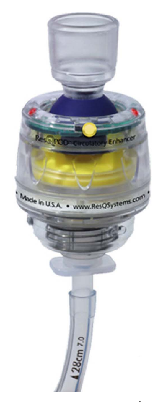
Fig. 1. Impedance threshold device (ResQPOD<sup>®</sup>).

All cardiac arrest patients from presumed non-traumatic aetiology received BLS (including automated external defibrillation if indicated) and ALS resuscitation care according to European Resuscitation Council (ERC) and American Heart Association (AHA) Guidelines [16]. Conventional manual