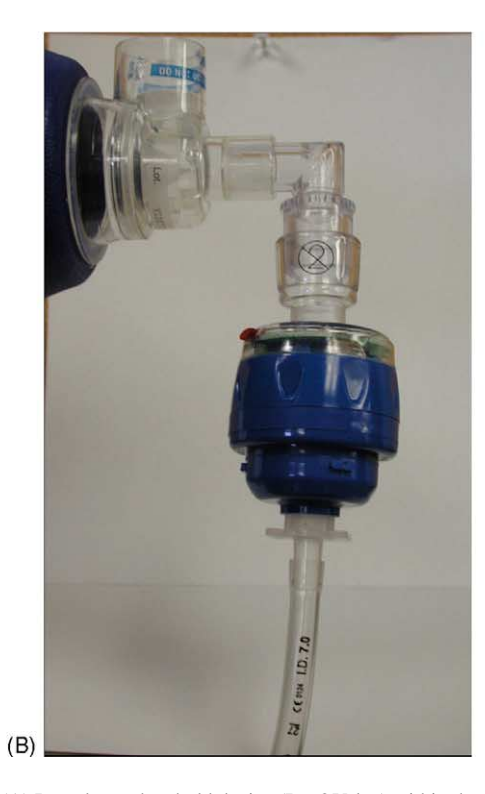
Fig. 1. (A) Impedance threshold device (ResQValve) within the ventilation circuit (between the tracheal tube and ventilation bag). The pressure transducer for obtaining intratracheal pressures is shown in circuit. (B) Newer model impedance threshold device (ResQPOD<sup>®</sup>) within the ventilation circuit (between the tracheal tube and ventilation bag). This model includes ventilation timing assist lights.

observation that trained rescuers were providing excessive ventilation rates during CPR [12], after approximately 50% enrollment in this study, the study was temporarily halted. Investigators changed to a newer model of the ITD (Fig. 1B) that included ventilation timing assist lights, retrained EMS